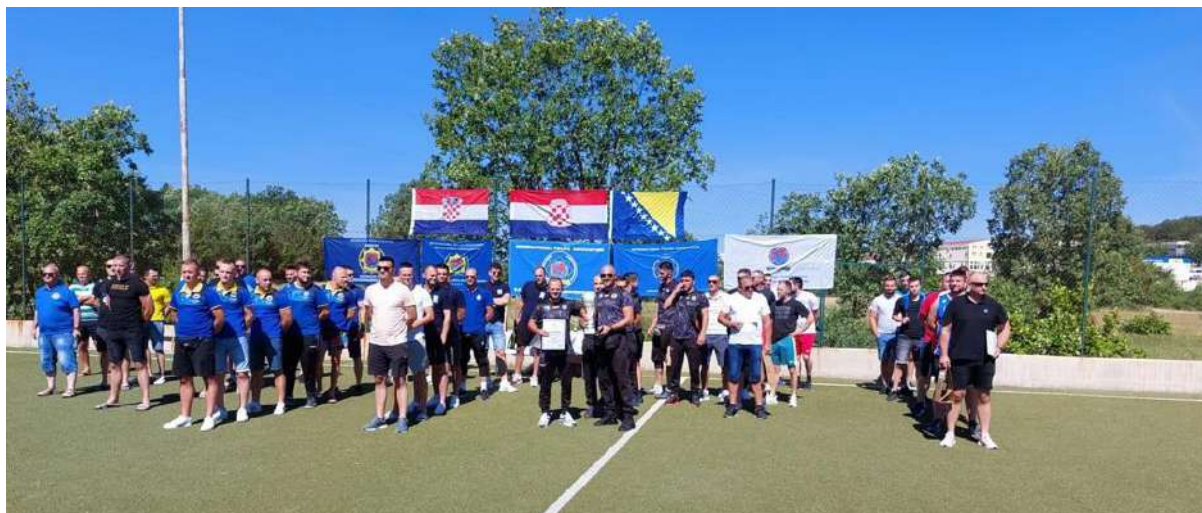
The official opening ceremony

The traditional 8 th International 5-a-Side Football Tournament IPA West Herzegovina (IPA ŽZH) was held on 18 th June 2022 at the sports centre in Posušje, Bosnia and Herzegovina (BiH). A new feature of the tournament was that it formed part the cultural and sports event "Posušje Summer 2022".