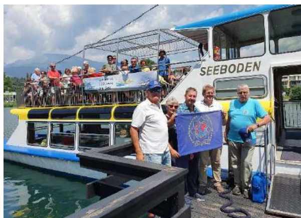
Schifffahrt auf dem Millstätter See

Ein Tagesausflug am Mittwoch führte uns in die Mosaikstadt im italienischen Spilimbergo am Tagliamento Fluss.