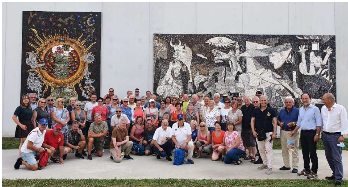
Besuch der Mosaikschule in Spilimbergo

Die Besichtigung mit Führung in der weltbekannten Mosaik-Schule in der alte Mosaik-Techniken gelehrt werden, war für die Teilnehmer sehr interessant.