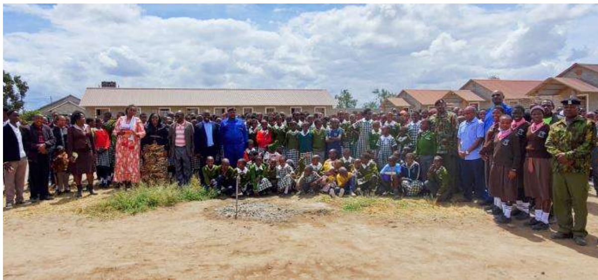
Joint group photo with the school community

The Inspector General stated that the National Police Service acknowledged the difficult past that most of the girls had been through, and assured them that the future is brighter for those who choose to take full advantage of the opportunity that the Rescue Centre has offered them to get quality education in a safe and secure environment.