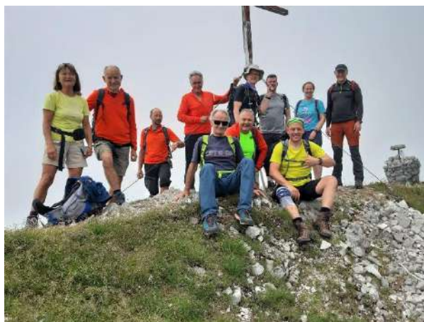
Wanderung zum Spitzegel

Am Freitag stand Alm-Picknick auf dem Programm. Zum Picknickplatz, auf der italienischen Seite des Nassfeldes, der Winkel-Alm, wurden 4 unterschiedliche Wandermöglichkeiten dorthin, je nach Fitness und Interesse, angeboten.