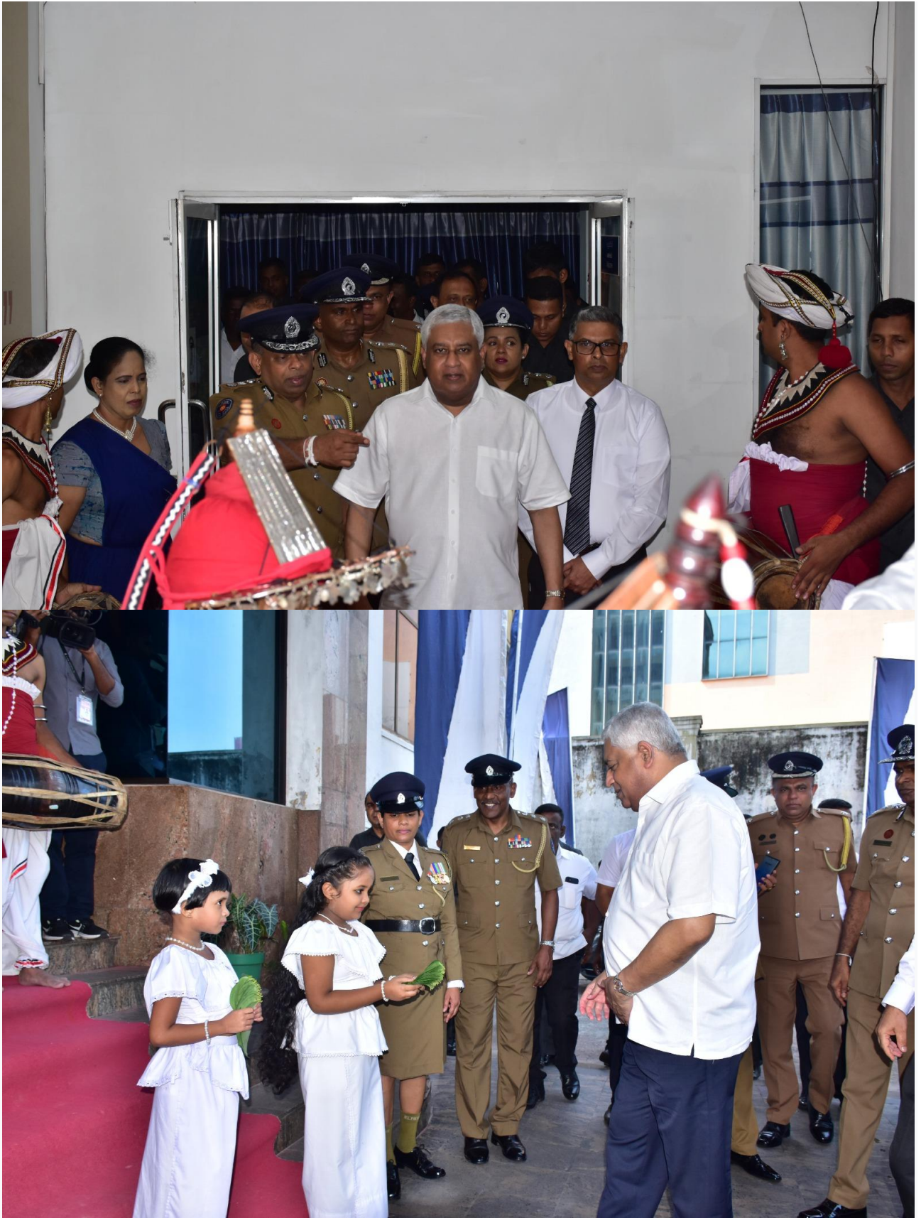
Media Spokesman's Office Police Media Division.